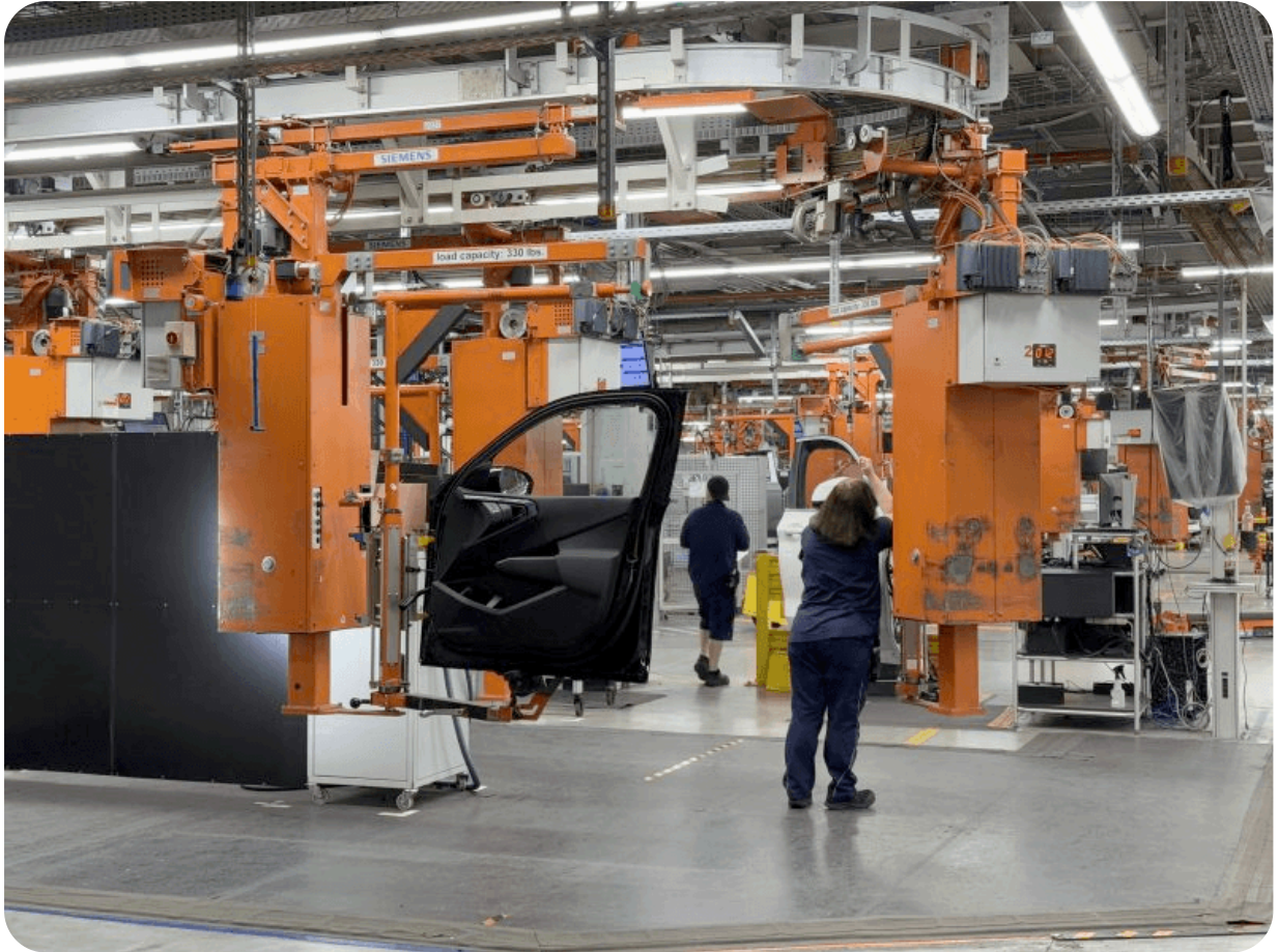
Production line with car doors, which are currently manually inspected after assembly

Motius developed a generative AI pipeline that can create large amounts of realistic image data, which show various defects and quality issues on door panels for cars. The customer (large automotive OEM) uses this synthetic data to train machine learning models, which can detect 99% of likely defects with only a very limited data set of 15 real photos.